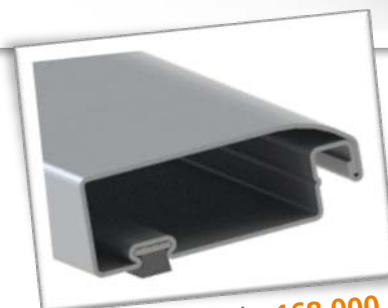
Sealing brush: 168 000