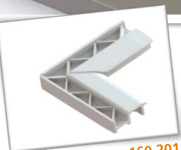
Internal corner: 160 201